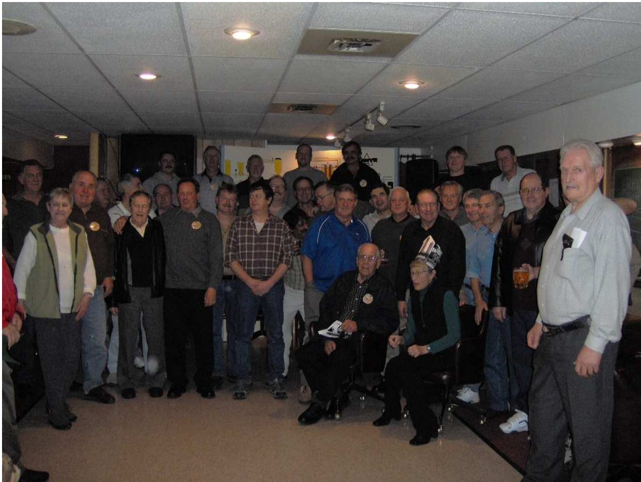
KRAFT MILL VETS PORT ALBERNI, REUNION HELD ON NOV. 17, 2007 AT THE SOMASS LEGION.